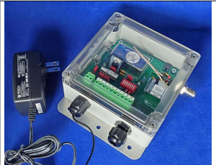
Dimensions (with mounting plate) 6.3" L x 4.8" W x 2.3" H