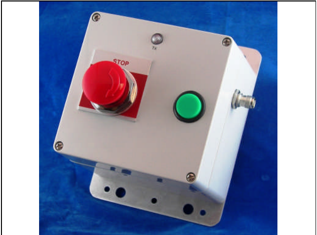
Dimensions (with mounting plate) 6.3" L x 4.8" W x 4.3" H