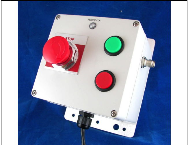
Dimensions (with mounting plate) 6.3" L x 4.8" W x 4.3" H