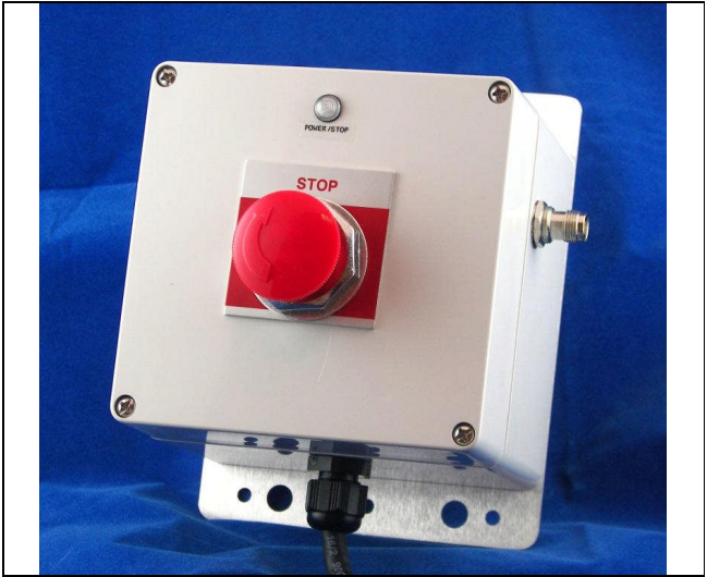
Dimensions (with mounting plate) 6.3" L x 4.8" W x 4.3" H