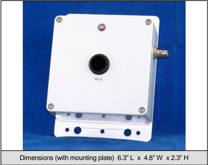
Dimensions (with mounting plate) 6.3" L x 4.8" W x 2.3" H