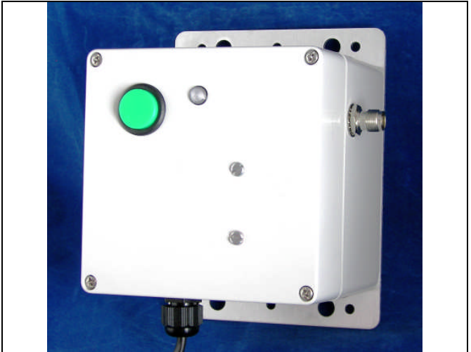
Dimensions (with mounting plate) 6.3" L x 4.8" W x 4.3" H