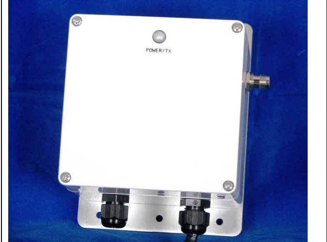
Dimensions (with mounting plate) 6.3" L x 4.8" W x 4.3" H