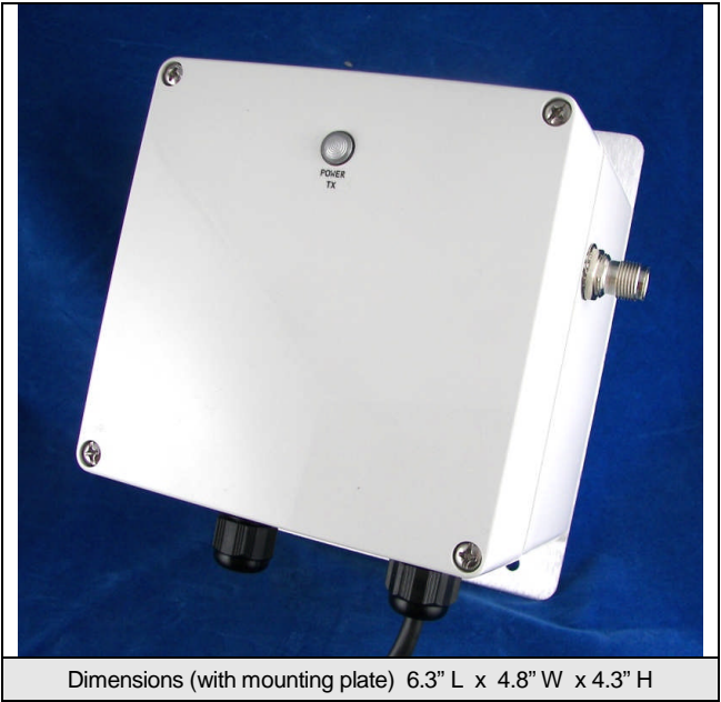
Dimensions (with mounting plate) 6.3" L x 4.8" W x 4.3" H