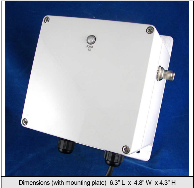
Dimensions (with mounting plate) 6.3" L x 4.8" W x 4.3" H