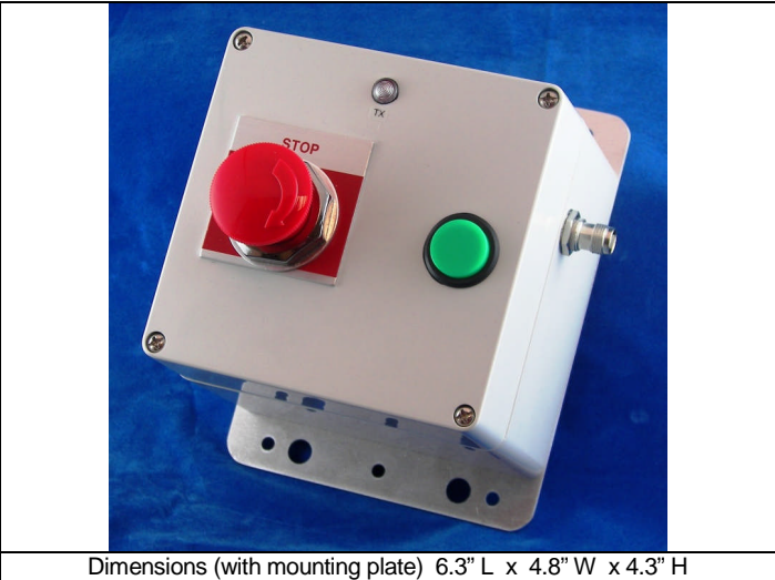
Dimensions (with mounting plate) 6.3" L x 4.8" W x 4.3" H