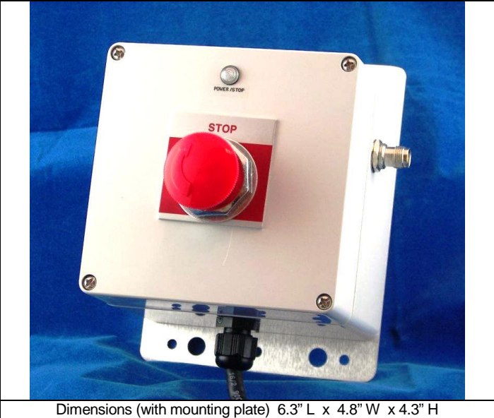
Dimensions (with mounting plate) 6.3" L x 4.8" W x 4.3" H