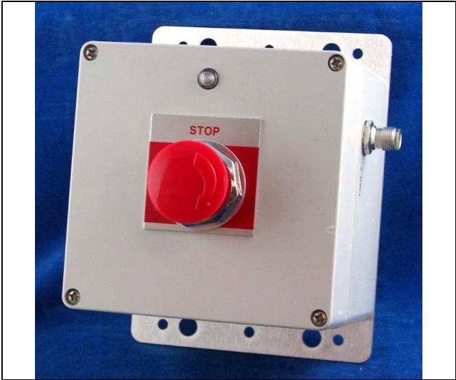
Dimensions (with mounting plate) 6.3" L x 4.8" W x 4.3" H