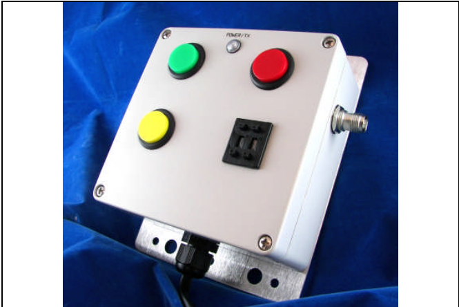
(Note – similar model 44-1420-3B Pictured) Dimensions (with mounting plate) 6.3" L x 4.8" W x 2.3" H