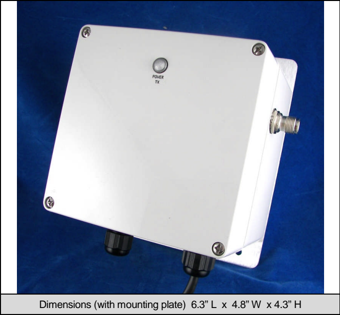
Dimensions (with mounting plate) 6.3" L x 4.8" W x 4.3" H