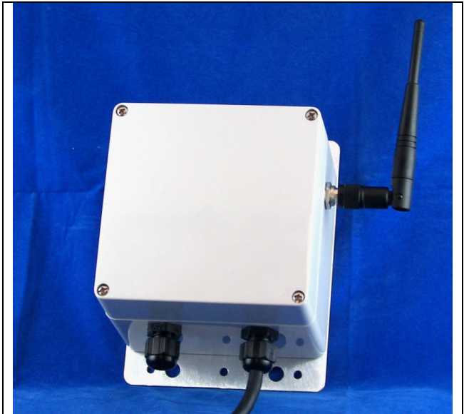
Dimensions (with mounting plate) 6.3" L x 4.8" W x 4.3" H