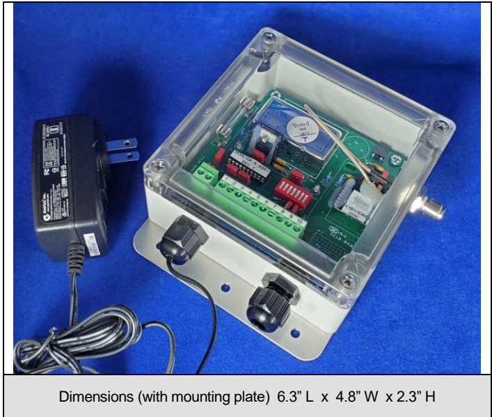
Dimensions (with mounting plate) 6.3" L x 4.8" W x 2.3" H