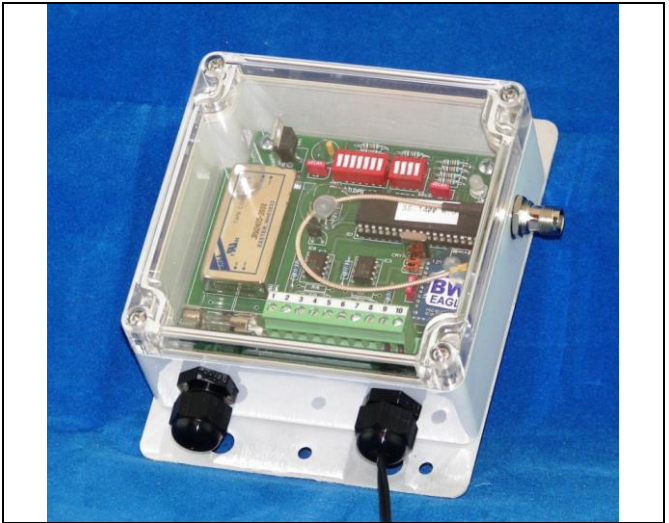
Dimensions (with mounting plate) 6.3" L x 4.8" W x 2.3" H

Transmission occurs when 5-24VDC is applied to the input. Transmission continues while 15-24VDC is present and ceases when 5-24VDC is removed.