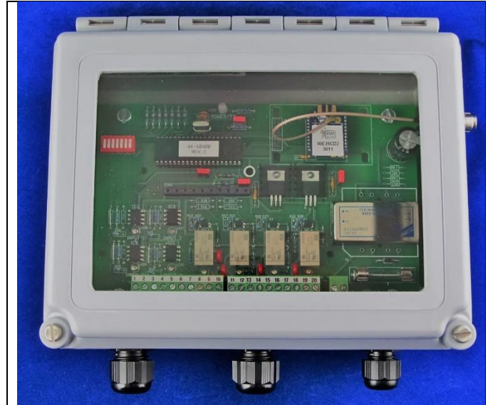
*Note – DC powered version pictured