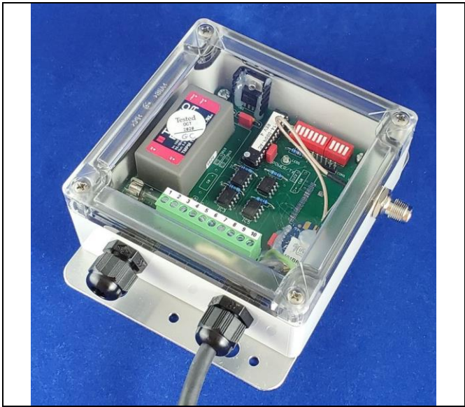
Dimensions (with mounting plate) 6.3" L x 4.8" W x 2.3" H

Transmission occurs when 120VAC is applied to the input. Transmission continues while 120VAC is present and ceases when 120VAC is removed.