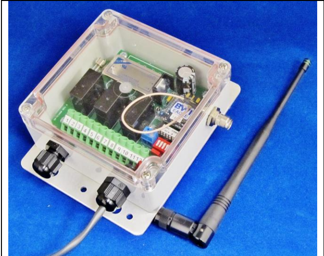
Dimensions (with mounting plate) 6.3" L x 4.8" W x 2.3" H