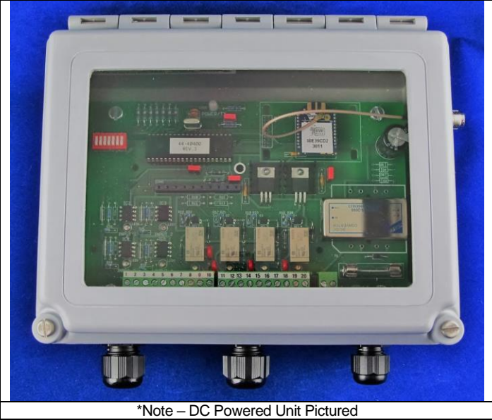
*Note – DC Powered Unit Pictured