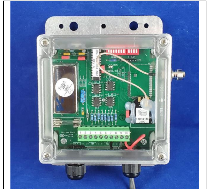
Dimensions (with mounting plate) 6.3" L x 4.8" W x 2.3" H