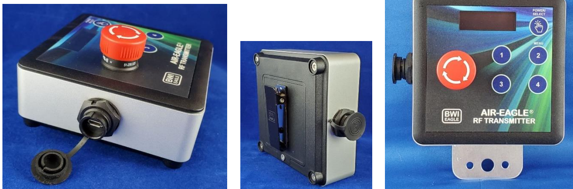
Photo on right shows unit with optional mounting plate