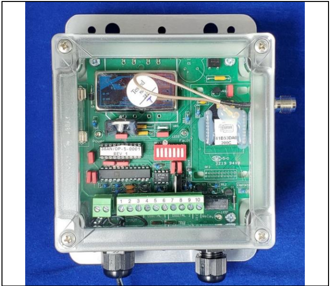
Dimensions (with mounting plate) 6.3" L x 4.8" W x 2.3" H