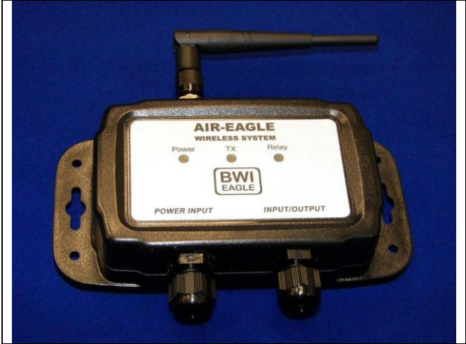
Dimensions (with mounting plate) 7.07L x 3.57W x 1.62H

When 5-24VDC appears on the input the unit transmits to energize relay 1 (or another relay as selected by the channel code transmitted) in any receiver within transmit range. The signal transmits continuously as long 5-24VDC is present and ceases when 5-24VDC is removed.